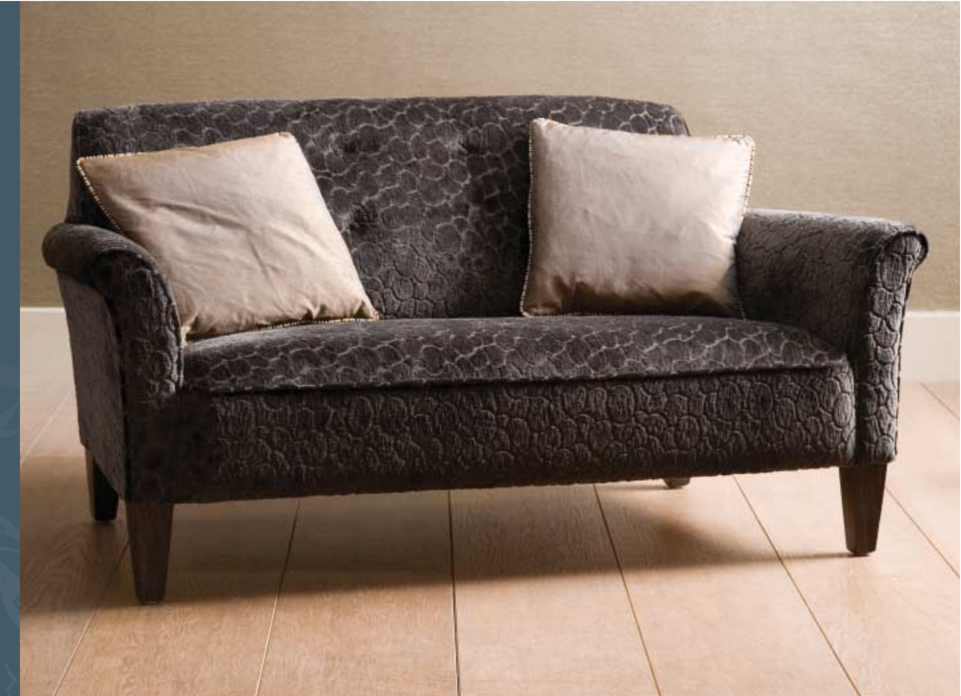
George Sofa shown in Medford Coal with Mars Peppercorn scatters piped with Karla Garnet

T: +44 (0) 115 946 2121 F: +44 (0) 115 946 0030 sales@hendersonrussell.co.uk www.hendersonrussell.co.uk