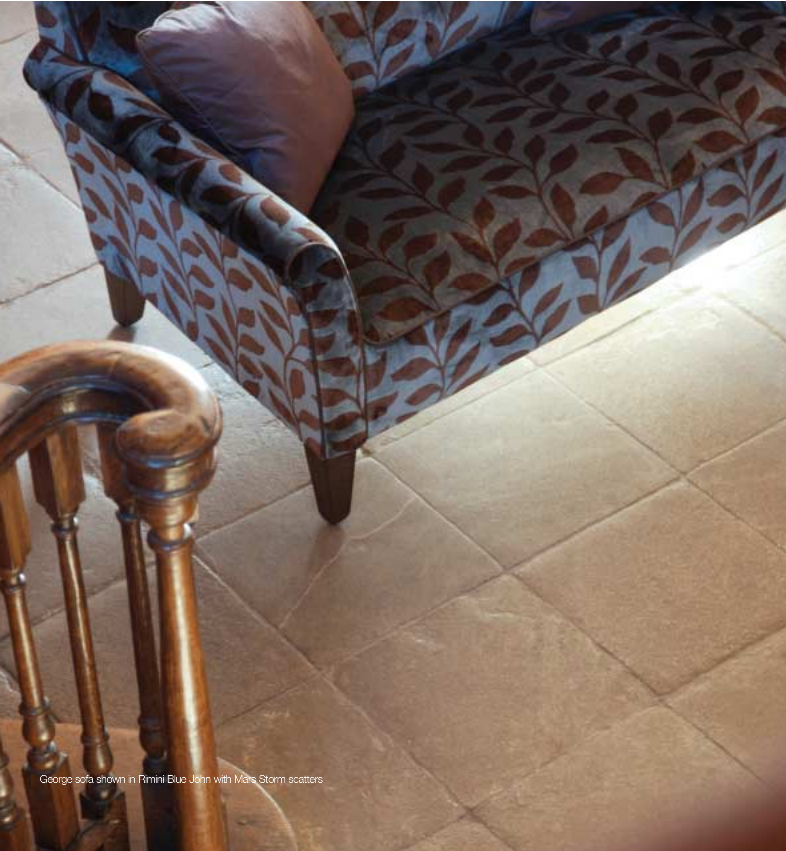
George sofa shown in Rimini Blue John with Mars Storm scatters